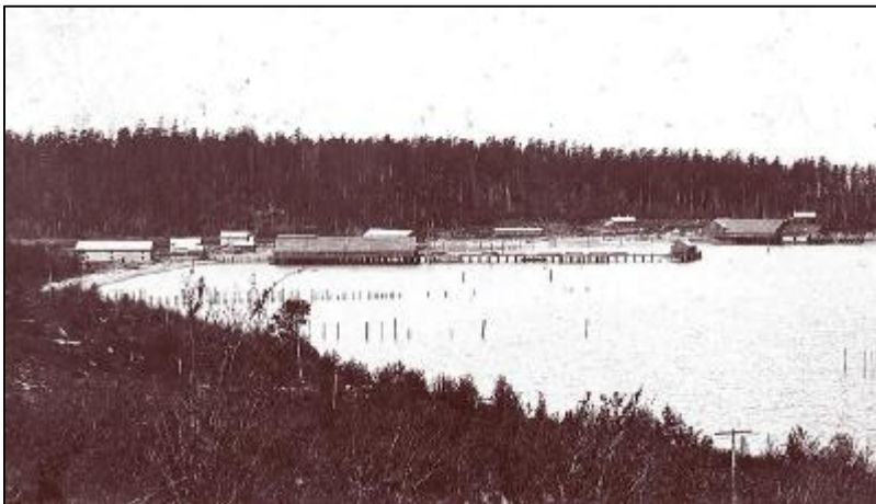
Ship Harbor, c. 1900