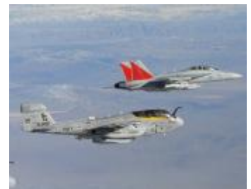
EA-6B Prowler with the EA-18G Growler