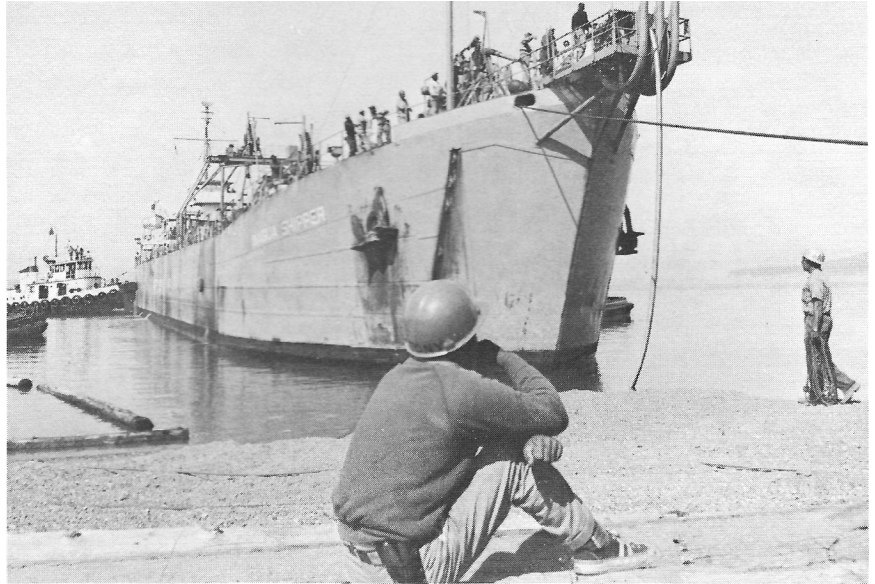
The start of cable laying at Sunset Beach in 1951.

In 1951 and 1952 the submarine electrical cables were laid from Sunset Beach to Decatur Island, and from there to the other islands. At the time it was the longest salt water electrical cable system in the world. Before their installation, all power in the islands was supplied by diesel generating plants run by Orcas Power and Light Company ( OPALCO ), which was (and still is) a rural electrical cooperative organized by the people on Orcas Island.